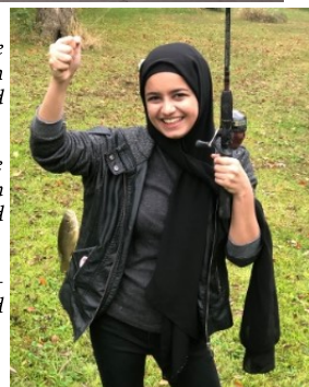
Rockford Park District Foundation was awarded funding through the Arts & Humanities and Youth & Families focus areas, respectively.