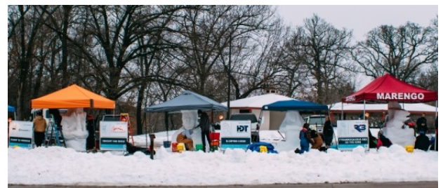
Above: Teams work on their sculptures at the Illinois Snow Sculpting Competition in Simnississippi Park

To learn more visit CFNIL's grant resources webpage and look for the "Proposal Review Guidelines" section.