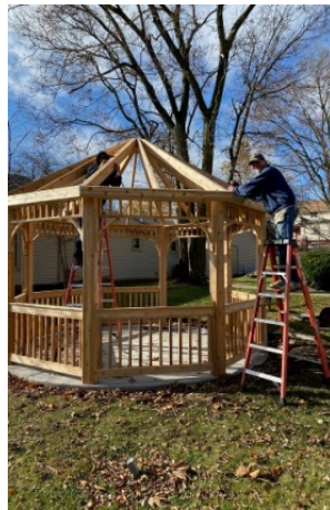
Left: Students visit Coronado Theater and sit in renovated historic furniture. Right: Workers build new gazebo at the Heritage Museum Park. Friends of the Coronado and Ethnic Heritage Museum received CFNIL Community Grants funding from the Arts & Humanities focus area.